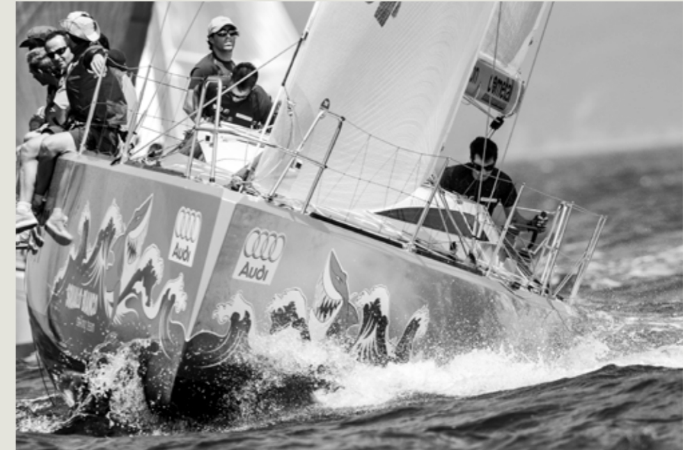
Above: the M37, the most winning boat in the ORC history. Ottavo Peccato/Squalo Bianco, Punta Ala 2007

A passion, even before a job, unchanged during thirty years, which is now shared and supported by the whole team of Cossutti Yacht Design Studio and the signature of every projects, tirelessly pursuing the ideal of creating boats with excellent performance, structurally reliable, manageable, with a light displacement and a distinctive design.