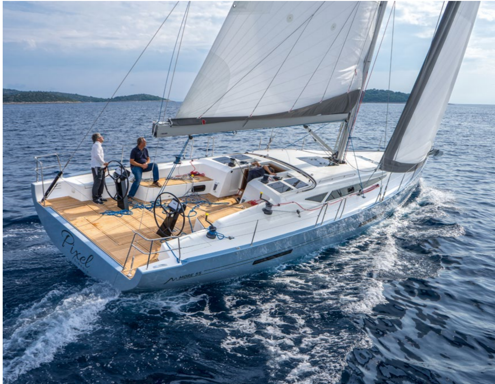
More 55 hull #1 "Pixel".