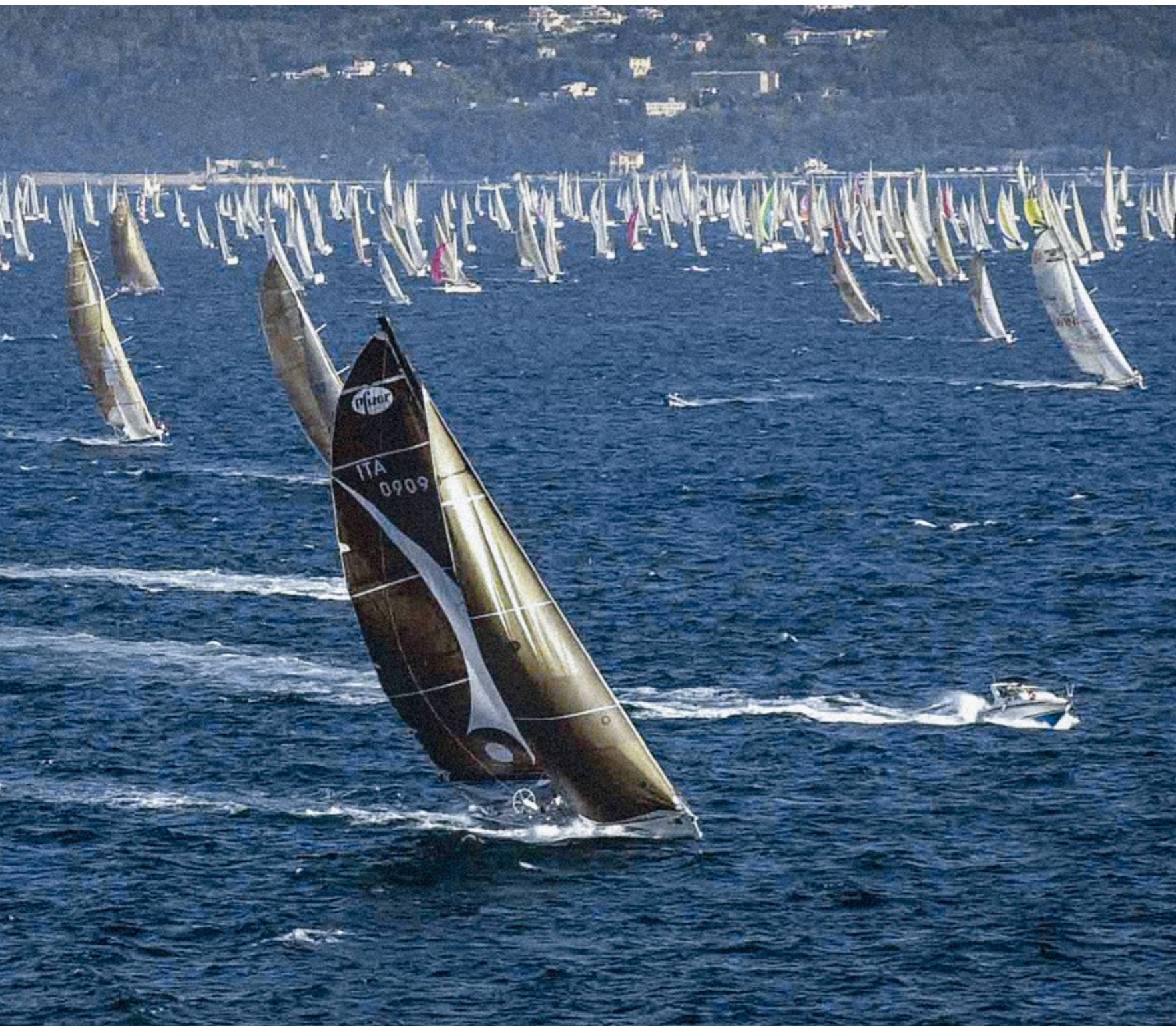
Barcolana 2001 - Cometa in front of the fleet after the start.