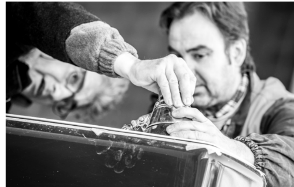
At work on the first prototype of the Italia 10.98, Cantieri Baruffaldi 2011.

So each project come from the drawing table but is then tested and verified during the actual production process and sometimes modified according to the specific client's needs.