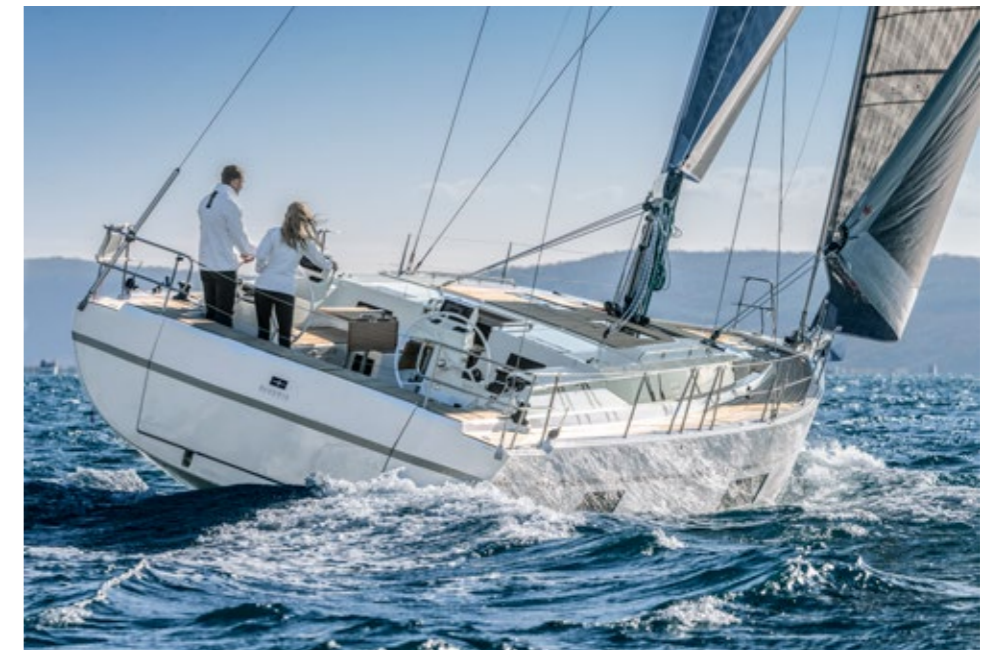
The brand new Bavaria C45 sailing during the very first sea trials.

All the challenges overcome in the last few years, first of all the portfolio expansion with cruiser projects as well as the several partnerships with major international boatyards, confirmed Cossutti Yacht Design as one of the world most interesting and appreciated design studio of the last 20 years both for racing and cruising yachts.