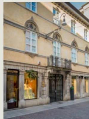
The new studio location, based in Udine.

“Is it possible to be good yacht designers without being sailors first? Maybe, but we don’t think so.”