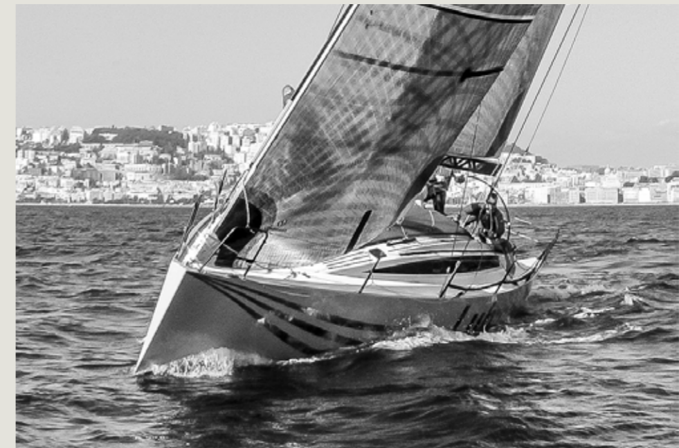
Below: the NM38 5 “Scugnizza” training in Naples, 2011.